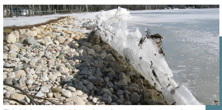
This higher-energy bioengineering project is protecting this shoreline from ice-push.

Restore native aquatic and wetland plants to shoreline areas. There is a continuum of options for erosion control for shorelines with increasing energy potential. The pictures to the right show examples of strategies for a relatively high-energy area. These examples show a coir log used in conjunction with fieldstone placed on a a 4:1 slope. Shallowsloped fieldstone is important for erosion protection and lake health. Your property does not necessarily have to be restored to predevelopment conditions, but it should provide many of the same benefits to a lake, such as habitat and shoreline stabilization. There is more than one right way to develop a bioengineered shoreline, so create a shoreline that incorporates your goals as well as changes that will benefit the lake. More information on recommended installation methods and procedures, and a list of Certified Natural Shoreline Professionals can be found at MiShorelinePartnership.org.