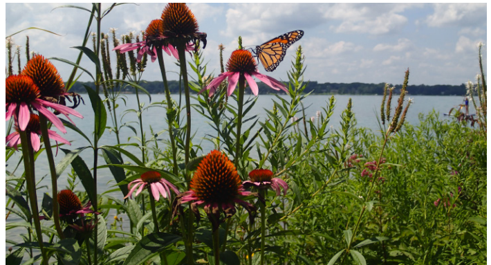
This bioengineered shoreline stabilizes the soil, slows runoff from upland areas, increases fish and wildlife habitat, improves water quality, and dissipates wave energy from wind and boats.

Bioengineering provides clean water, cover, feeding habitat for fish; nesting, basking, and feeding habitat for turtles, frogs, birds, butterflies, and other wildlife. Bioengineering also deters property damaging geese!