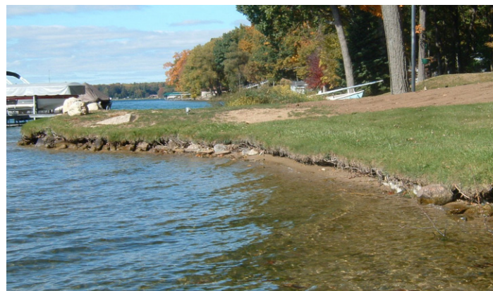
Turf-grass to the shoreline leads to poor lakeshore habitat. Poor biological health is three times more likely in lakes with poor lakeshore habitat. Forty percent of Michigan's inland lakes have poor lakeshore habitat.

of hardened shorelines and lawn to water's edge