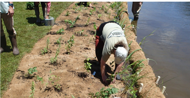
Bioengineering project being installed as part of the Michigan Natural Shoreline Partnership Certified Natural Shoreline Professional (CNSP) Training