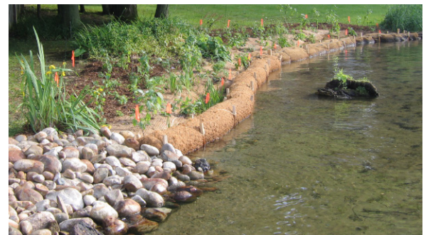
Bioengineering project right after installation.